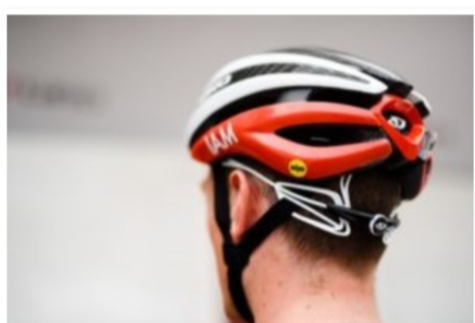
Figure 3: The Giro Synthe helmet is often used in road racing for its perfect balance of ventilation and aerodynamics.

Giro leverages GoEngineer's expertise for SOLIDWORKS training and for implementing EPDM. “We have multiple locations across the country, so the EPDM implementation was a challenge, but GoEngineer helped us each step of the way,” says Wesson. “Traceability is important for a company that sells safety-related products, and EPDM makes it easy to find files, no matter when and where they were created.”