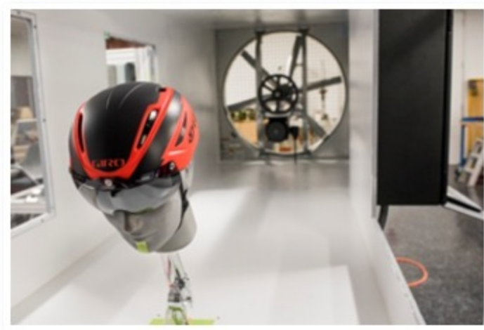
Figure 1: Giro Air Attack helmet in wind tunnel for aerodynamic testing.

Since 1985, Giro has been on the forefront of aerodynamic helmet design to improve athletic performance and will be sponsoring several athletes in the 2016 Rio Olympics .