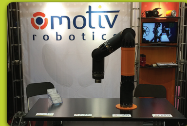
Motiv Industrial Robotic Arm