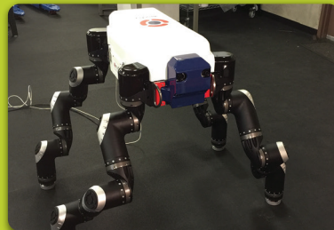
Motiv Robosimian Quadraped Robot